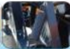
Spring floating system