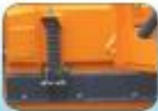
Bottom trip with spring system