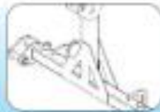
3P hitch mount