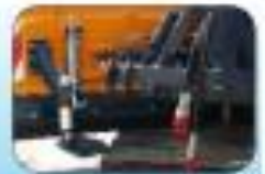
Hoses with quick couplings