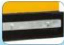
Rubber segment cutting edge