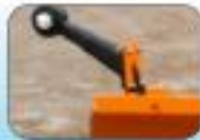
Side lamps 12V